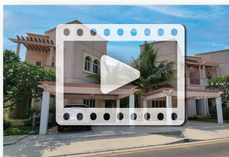
Layout type 1, Unit with patio (A/D)